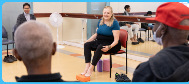
Fitness and Wellness Classes

If you are a DC resident, age 60+ and looking for ways to meet new people, stay fit, explore your creativity, and tap into your neighborhood resources, Around Town DC is the place for you. Virtual and in-person opportunities available.