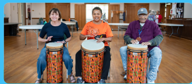
Arts and Social Opportunities