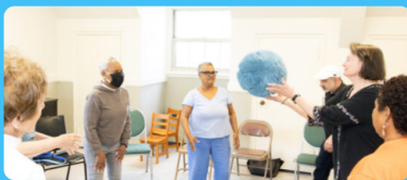
Recreational Programs Around DC