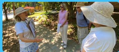
Special Events (Virtual and In-person)